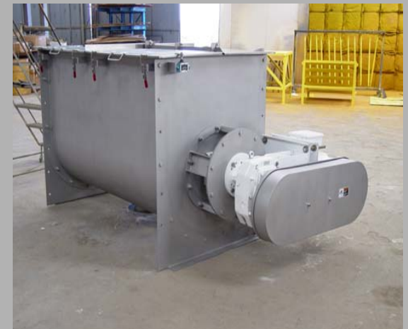
Stainless Steel Ribbon Mixer

*Ribbon-Paddle-Pin* *Mixers-Batch* *Replacement Mixer Reels*