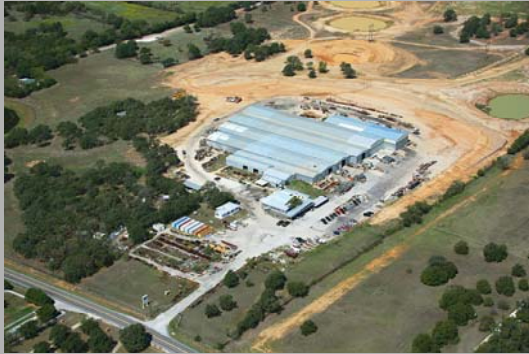
120,000 Sq Ft Facility