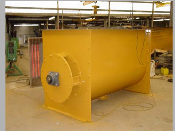
Carbon Steel Ribbon Mixer