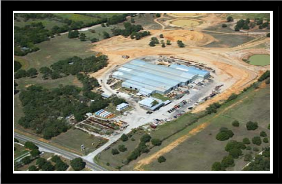
120,000 Sq Ft Facility